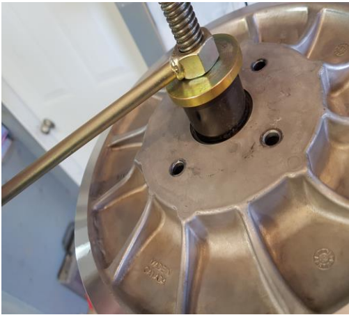
Compressor tool for helix bolt removal

Use holding tool. Remove the secondary pulley (rear clutch) by removing the center bolt.